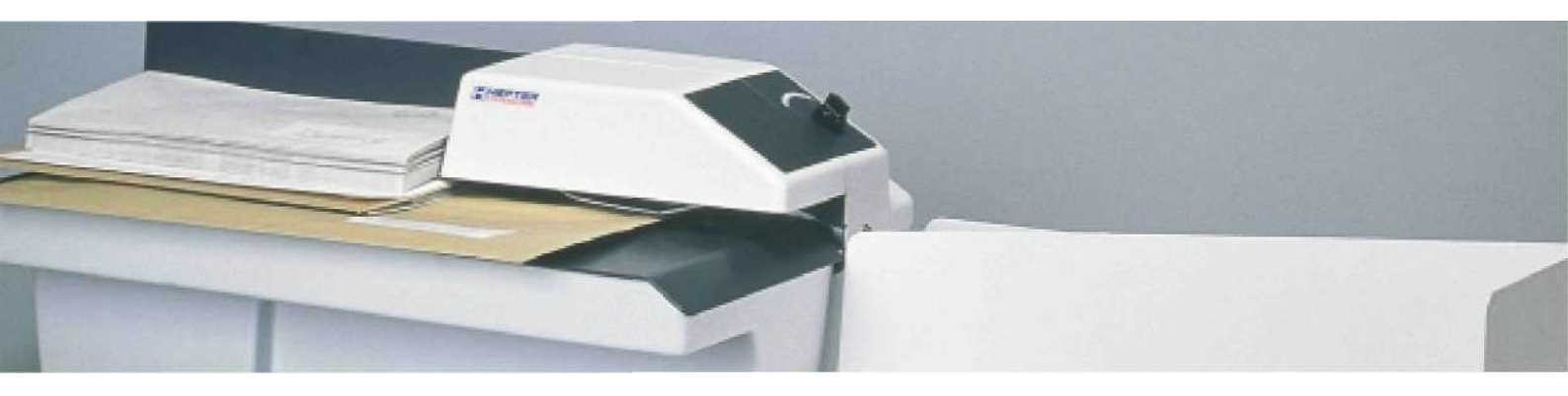
The fast way to open your incoming mail in time