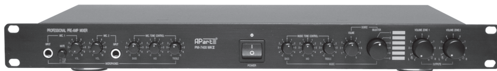
PM7400 MKII Professional two-zone stereo pre-amplifier/mixer