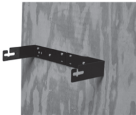
(1) Fix the brackets to the wall

This mounting system can be used for vertical, horizontal or ceiling mounting. If safety rules allow, it is possible to mount the MASK8 vertically with one bracket only fig.A However in that case we strongly recomend to use a extra safety cable.