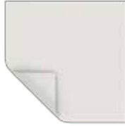
Perforated Matte White