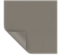
High Contrast Da-Tex