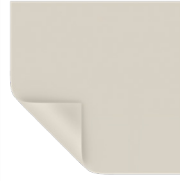
Ultra Wide Angle